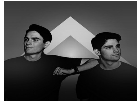
The Scally Brothers