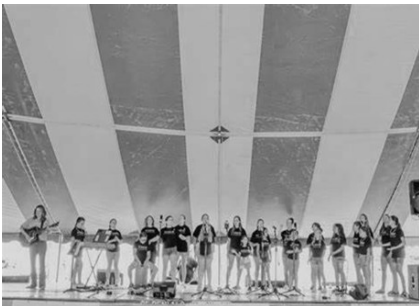
New Horizons Music Group

Join us for a Service Project and Christian Music to share Jesus' love!